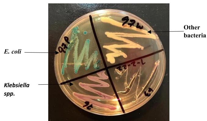
Figure 1: Isolation of Pure Bacterial Culture on Chromogenic Agar As a result of overnight incubation after FAM, growth was observed. The colonies of lactose-fermenting Coliform group of bacteria appeared as medium to large pink colonies. However, non-lactose fermenting non-Coliform bacteria appeared as colorless colonies that need further identification based on biochemical characterization. From these colonies, pure cultures were obtained by the streak plate method (Figure 2).

Pure bacterial cultures were first isolated from drinking water using chromogenic agar. The filter paper placed onto the chromogenic agar plate surface indicates the growth of specific bacterial colonies. Indications of the appearance of turquoise-blue colonies of E. coli and for Klebsiella mauve colonies were seen on chromogenic agar (Chromatic™ Coli Coliform) as mentioned by the manufacturer. While some other colorless colonies (Creamy/off-white color) of other bacterial species belong to the family Enterobacteriaceae (Figure 1).