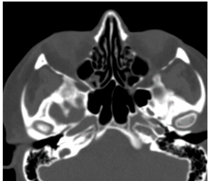
Figure 1: Axial CT scan of a male patient's head. The sphenoid sinus has several septa