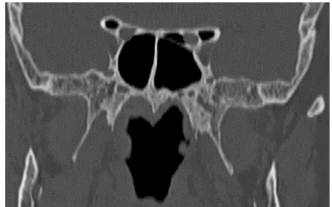
Figure 3: Coronal CT head scan of a male patient. Transversal septum in the projection of left optic canal as well as pneumatization of anterior clinoid processes

accessory septa on the right and left in three cases, and an accessory septum on the right in one. As soon as three accessory septa were found, two of them were on the right and one of them was in a different place. Based on the analysis of CT images we conclude about existing more than one septum in the sphenoid sinus in 25 patients or 23%. In cases of existing three accessory septa in males and females, sphenoid sinuses were hiperpneumatized towards greater wings and pterygoid process. We also observed a transversal septum in the projection of the optic canal with the consecutive formation of the Onodi cell, which will be the subject of future studies(Figure 3).