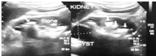
Figure 3: Showing renal stones with renal cyst in a patient of 62 years old