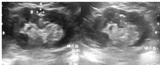
Figure 4: Showing milk of calcium cyst measuring 6.1 mm x 6.9 mm at the middle pole left kidney in a patient of 65 years old.