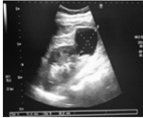
Figure 2: Simple cyst measuring 51.4 mm x 48.8 mm in a patient of 60 years at the lower pole of left kidney