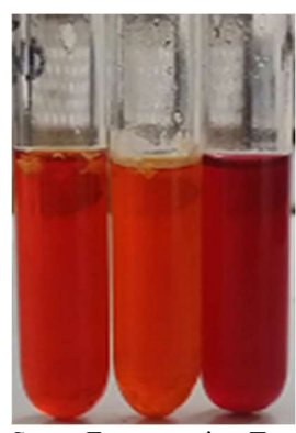
Sugar Fermentation Test