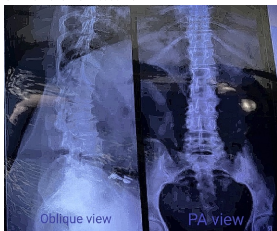
Figure 2: Showing anterolisthesis in oblique view and scoliosis in