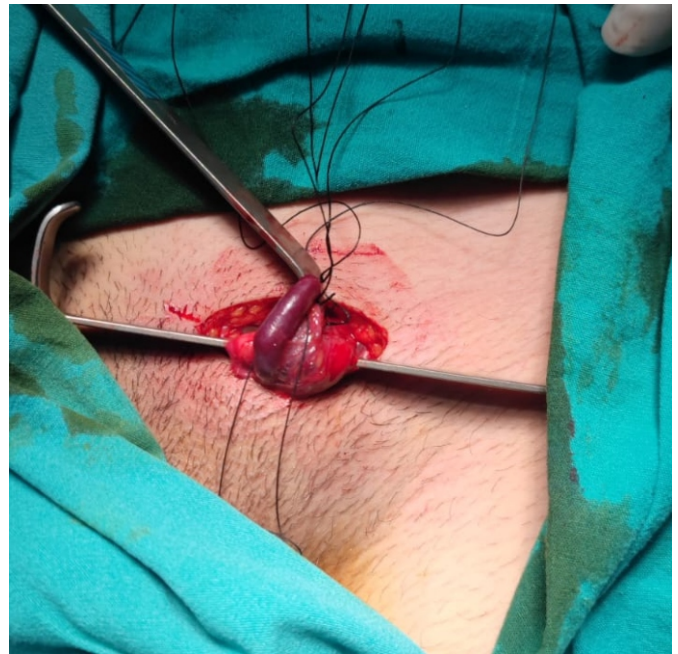
Figure 1: Intraoperative view

This study included patients who presented to our clinic due to varicocele and underwent surgical procedures between November 2020 and January 2023. Patients with incomplete or inadequate data were excluded from the study. Data such as age, side, preoperative spermiogram parameters, preoperative ultrasound findings, and the number of veins ligated during surgery were recorded through the retrospective screening of patient files. Additionally, the recurrence rate was recorded and analyzed. All patients who presented to our clinic with symptoms of scrotal swelling and/or pain underwent a thorough history taking and physical examination. For all patients where there was a suspicion of varicocele based on the physical examination, a spermiogram, and an ultrasonography scan were requested. Surgical intervention was planned as necessary for relevant patients. A transverse skin incision measuring three centimeters is made over the external inguinal ring and continues until it reaches the Scarpa fascia. The index finger is then used to dissect the Scarpa fascia. Following the securing of the cord structures with an army-navy retractor, the Babcock clamp is used to grip the cord structures. Incisions are made in the external spermatic fascia with the assistance of a surgical microscope, and 4-0 ties are used to ligate all of the veins that are located within the spermatic cord as shown in the Figure 1 [6].